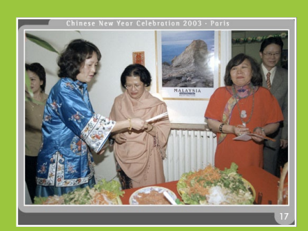
H.E. the Ambassador leading the "Yee Sang" with a long pair of chopsticks.

The Embassy of Malaysia, in collaboration with MAF hosted a Chinese New Year celebration on Saturday, 1 February 2003 at the Embassy. About 150 people joined in the celebration, with families and local friends. MAF sincerely thanks all the attendees that came and for the food contribution that was so kindly contributed to the level of success we had. It was a great celebration with Chinese, Malay, Indian and Western food, making the event a feast of real Malaysian warmth and hospitality. Syabas to all!