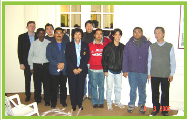
The Committee Members 2005.

MAF held its AGM at the Malaysian Embassy on 5 March 2005. Besides some old familiar faces, there were new ones seen at the meeting. MERCI BEAUCOUP to the outgoing committee 2004 for all their efforts and contributions and TAHNIAH to the new elected committee members for 2005. Ladies, blame yourself if you were not at the AGM, as the committee was forced for a 100 percent men's team this year. Good luck guys!