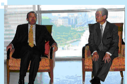
François Loos with Pak Lah

ed by the Federation of Malaysian Manufacturers (FMM) and the Malaysian French Chamber of Commerce and Industry (MFCCI) where the signing of a Memorandum of Understanding (MoU) for the setting of the Malaysia French Business Council (MFBC) took place.