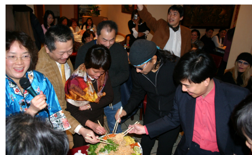
Yee Sang !