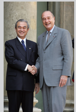
The Hon. PM with President Chirac.

He said bilateral relations between Malaysia and France were good and both of them agreed that economic cooperation be enhanced. (Bernama)