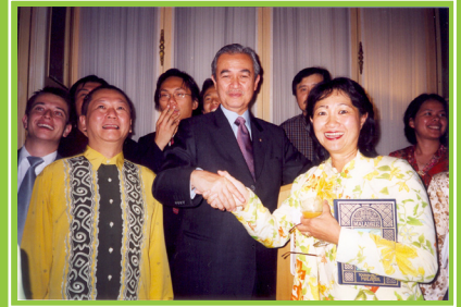
Souvenir Hand shake with the PM.

During the visit of the Hon. Prime Minister, Dato' Seri Abdullah Haji Ahmad Badawi to France, a meeting with the Malaysian community was held at Hotel Ritz Paris on 21 July 2004. More than 200 Malaysians including students and officials from the Royal Malaysian Navy based in Cherbourg attended the reception. In his address to Malaysians, the Hon. Prime Minister advised Malaysians in France to play their role to market Malaysia as a tourist destination among the French. In addition, Malaysians should also embrace a culture based on the philosophies of "Excellence, Glory and Distinctions".